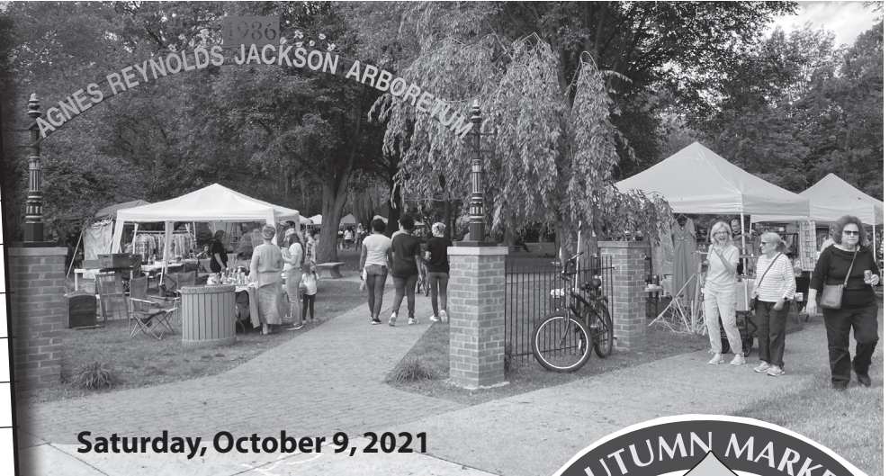
Saturday, October 9, 2021