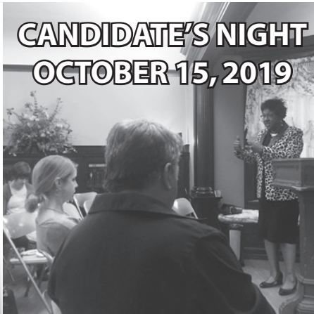
CANDIDATE'S NIGHT OCTOBER 15, 2019