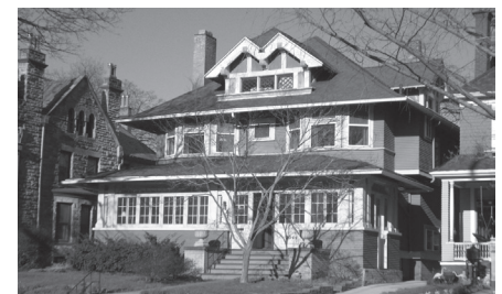
The Whinery-Klunk Home 2044 Robinwood Ave.