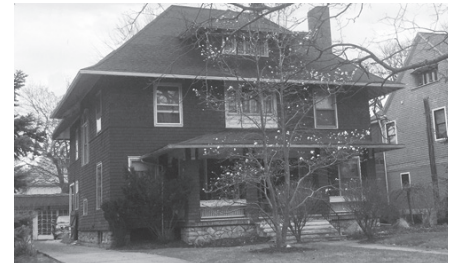
The Milroy-Ellis Home 2236 Robinwood Ave.