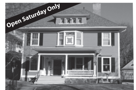
The Mills-Duffy-Pinson Home 2268 Scottwood Ave.