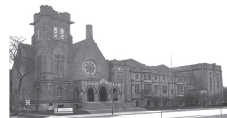
Collingwood Presbyterian Church 2108 Collingwood Blvd.