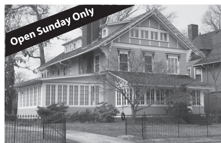
The Marshall-Mitchell/Chablani Home 2347 Robinwood Ave.