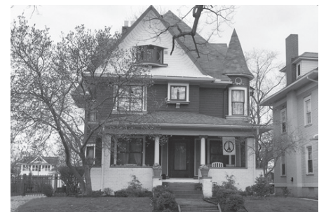
The Gilbert-Radley Home 2317 Glenwood Ave.