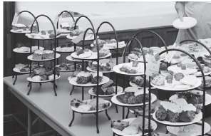
SUNDAY MAY 15, 2022