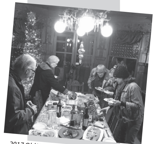
2017 Old West End Holiday gathering at the Libbey House on Tuesday December 20th.